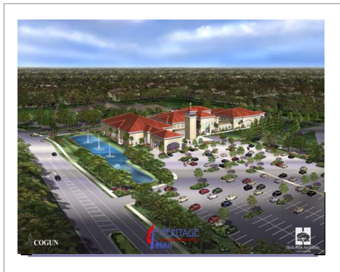
Artist's Rendering of master plan for Heritage.

I am delighted to tell you that the City has been impressed with our plans and the level of detail that Cogun, Hamilton Engineering and Hyde Park Architects have been able to provide them. They were very encouraging and appreciated being kept in the loop as we planned the building. Early on, we were told that the permitting process could take anywhere from 3–9 months. The City has been kept appraised of our progress and plans and told Cogun that they would be able to turn our permits around in 4 weeks after the final drawings were submitted. If there were any questions, they would respond within 2 weeks of receiving any resubmittal of information. We need to be realistic, there will be ques-